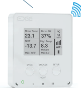
Embedded Digital Data Logger