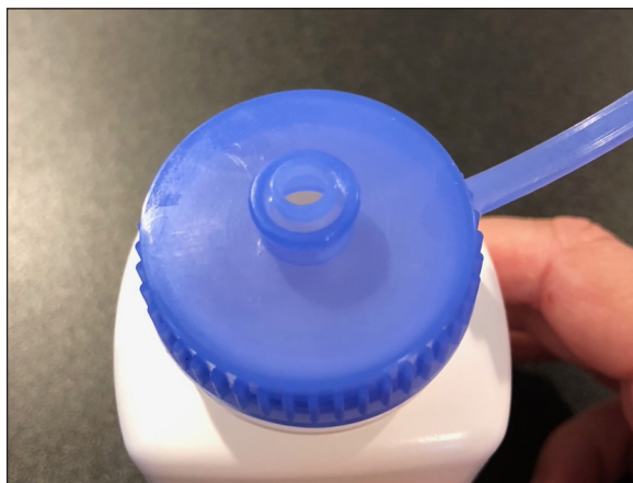
Started (not down all the way)

The Adapter Cap is intended to be leak resistant, not leakproof. It is made of flexible polyethylene so it can conform to different bottle sizes with various wall thicknesses. It does not have an inner sealing ring or compression sealing feature. This allows it to deform when air or liquid is displaced by squeezing the bottle.