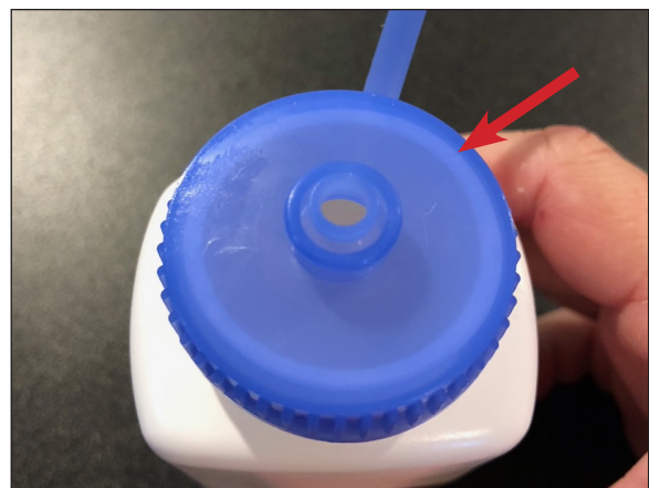
Bottle touching the Adapter Cap sealing surface as seen through the cap.