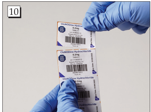
Step 10. Each blister can be torn from its strip and stored or dispensed to the patients.