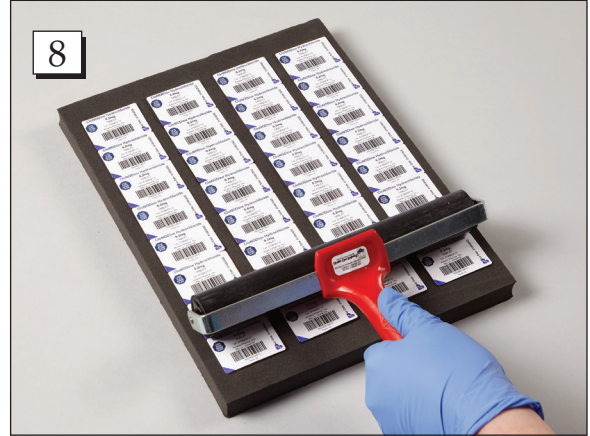
Step 8. Enhance the seal by applying moderate pressure to the sealed blister strips using a sealing roller.