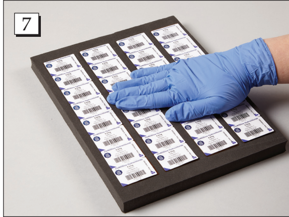
Step 7. Gently press the labels onto the blisters.