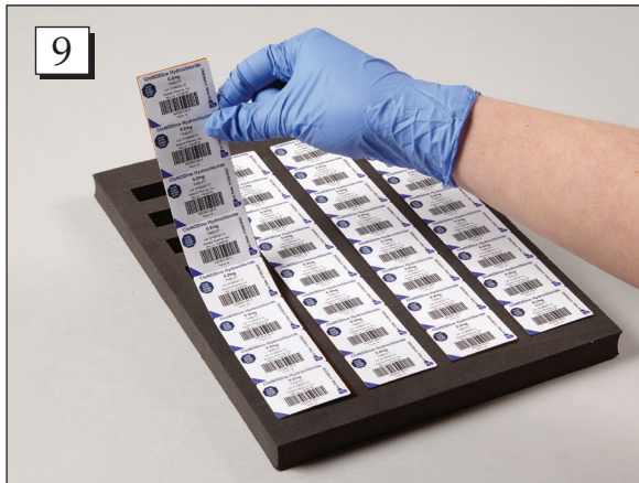
Step 9. Remove the strips from the sealing tray.